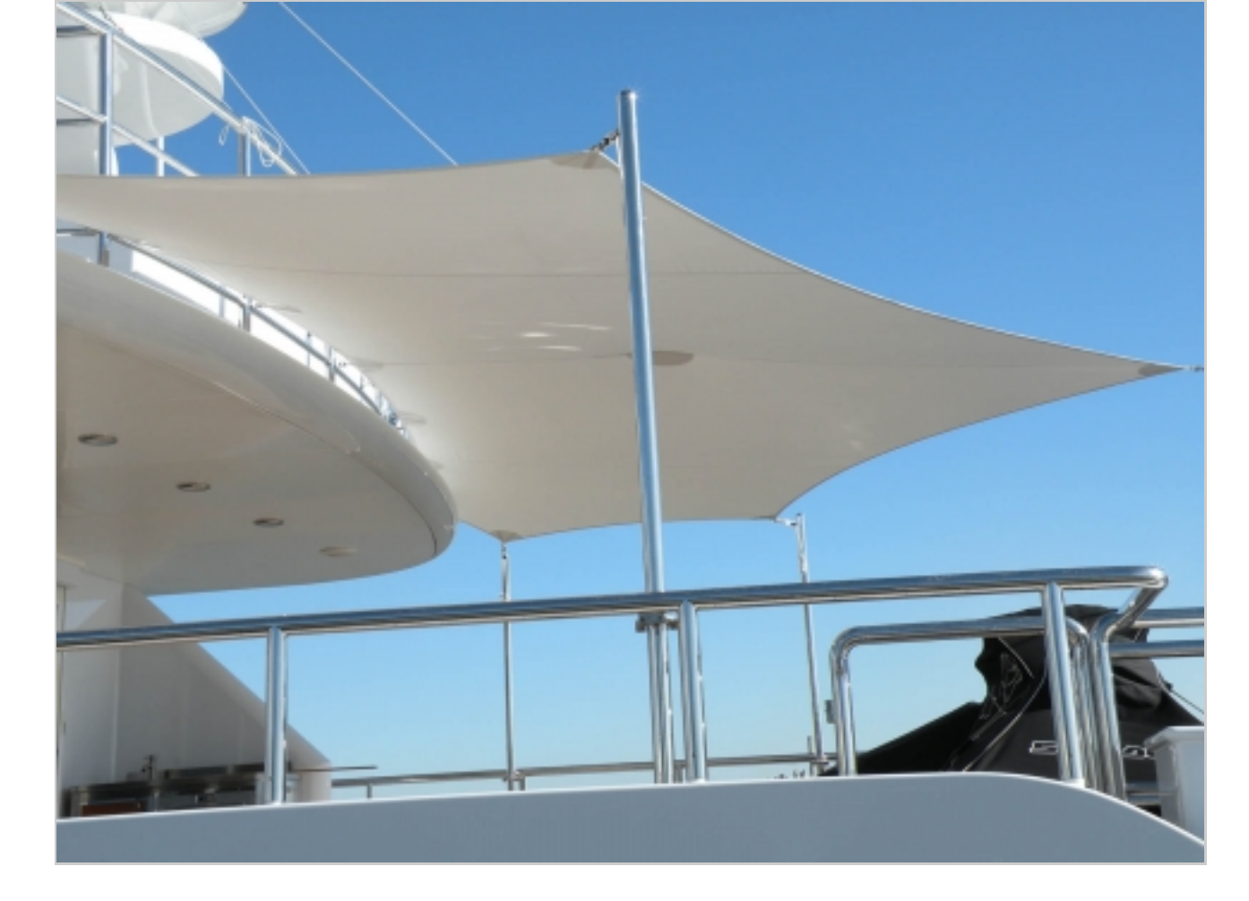
Outstanding Achievement Award Shade Structures SuperYacht Awnings David's Custom Trimmers

Copyright ©2016 Industrial Fabrics Association International (http://www.ifai.com/). All rights reserved.