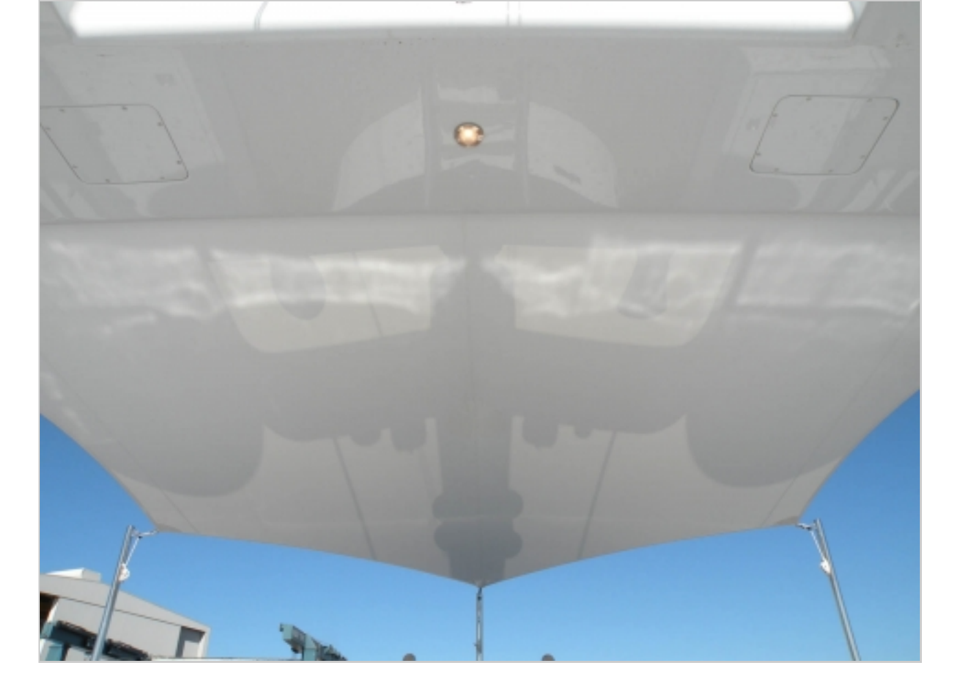
Outstanding Achievement Award Shade Structures SuperYacht Awnings David's Custom Trimmers