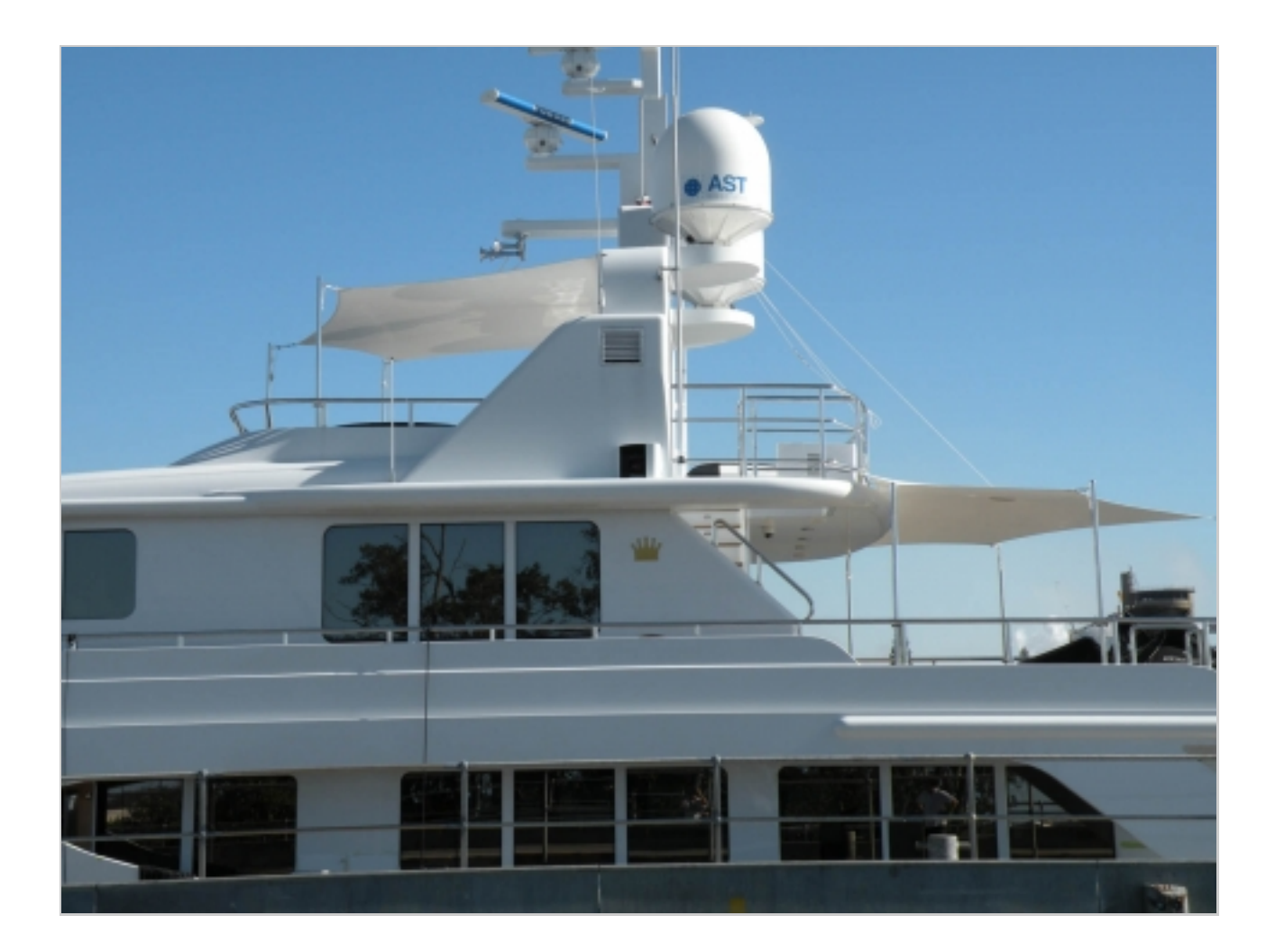
Outstanding Achievement Award Shade Structures SuperYacht Awnings David's Custom Trimmers